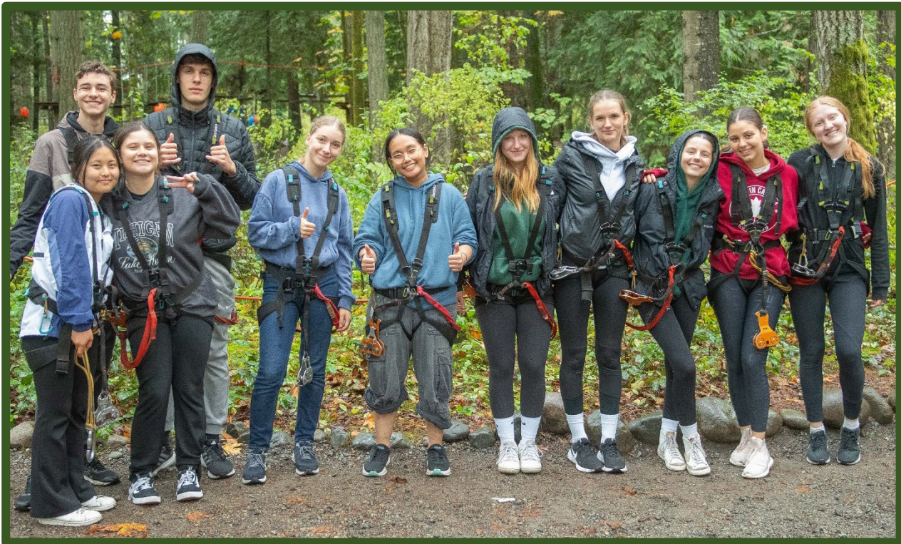
Wild Play Adventure Course Sept. 2024